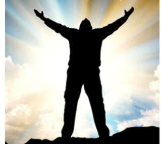
page Come, Lord Jesus! The Consequences