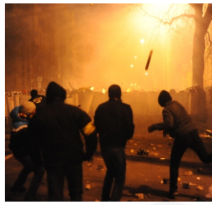
page The Perilous Times The Meaning The Nature Our Responds