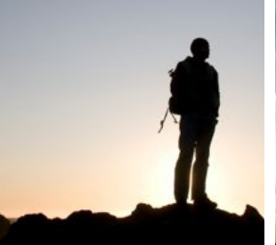
The Pilgrim's Diary